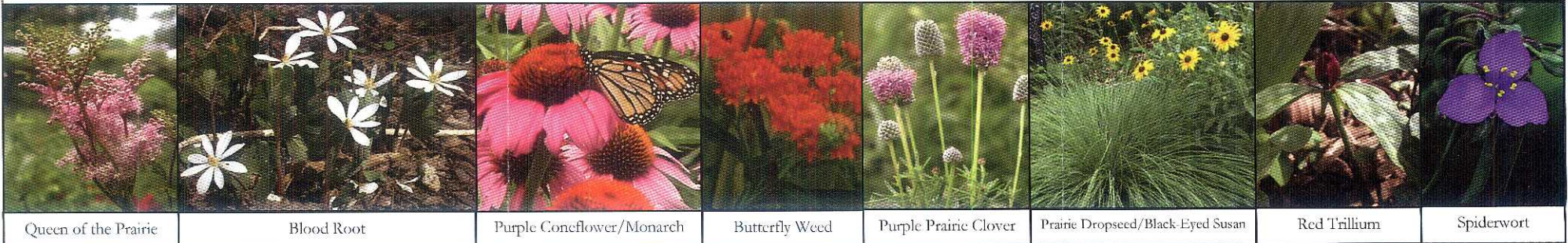
Queen of the Prairie