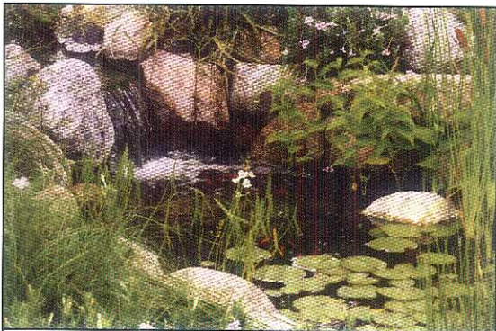
The water garden at The Conservation Foundation's McDonald Farm